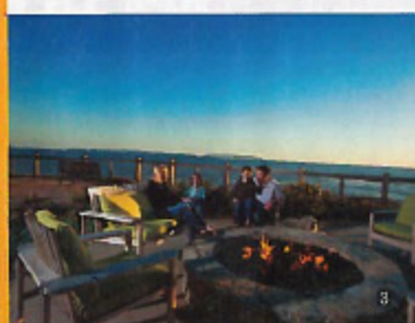
1. The Terranea resort overlooks the Palos Verdes Peninsula 2. The 140-foot waterslide is very popular with the kids 3. Enjoy sunset around the fire atop a hillside bluff.