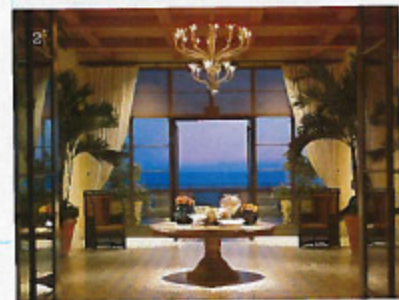
1. Built on the former home of Marineland, the sprawling resort has only been open since June 2009. 2. You will feel pampered, yet right at home, on this stunning property.

during our stay for unexpected maintenance, so I can't attest to its wildly entertaining ways. I did, however, hear from others whose kids spent hours the previous day going up and down the slide.