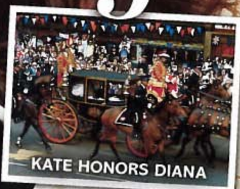
KATE HONORS DIANA