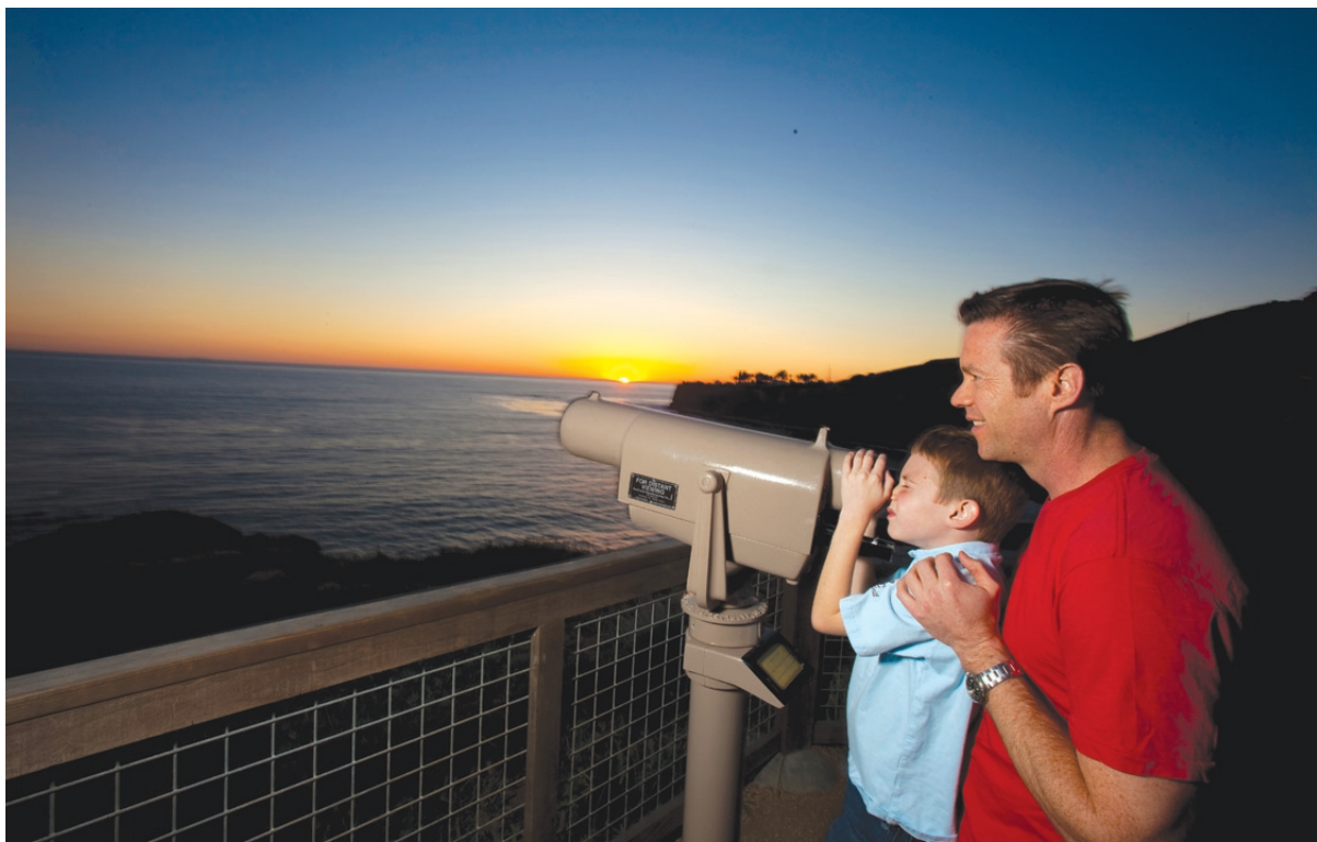
Spacious, comfortable and residential-like villas and casitas set the stage for the ultimate family getaway.