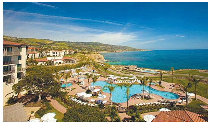
Terranea Resort in Rancho Palos Verdes.

Spacious, comfortable and residential-like villas and casitas set the stage for the ultimate family getaway, representatives said, with private entrances, full kitchens, living areas, laundry facilities and fireplaces.