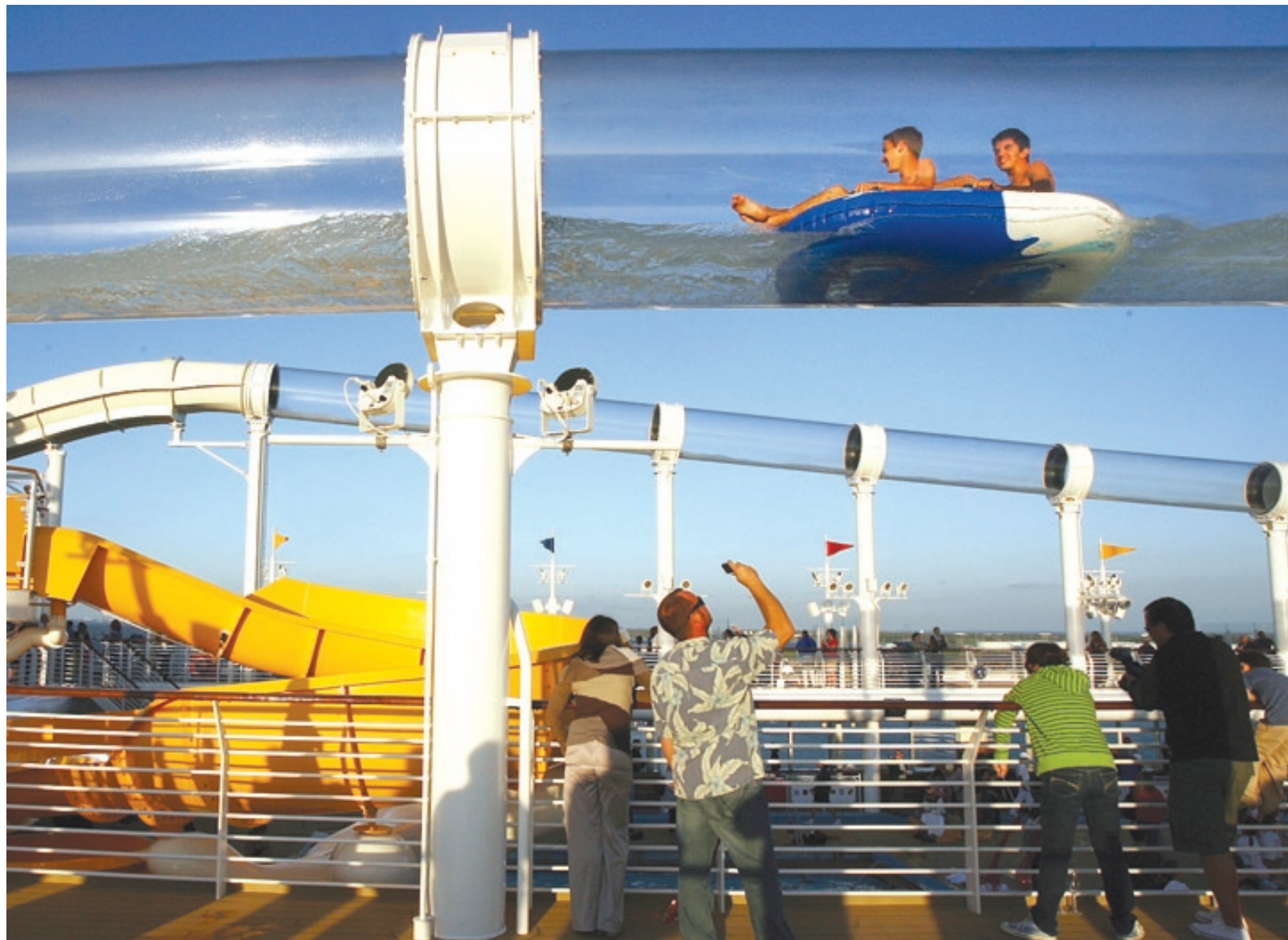
Riders move along the elevated 765 feet Aqua Duck "water coaster," above the Disney Dream ship. High powered water jets pump 10,000 gallons of water per minute to propel riders along.