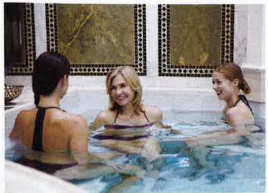
Clockwise from above: Women in the coed mineral pool at the Spa Montage Beverly Hills; the nail room at Exhale in Hollywood; a couples treatment room at the Spa at Terranea

Cultivating a California glow requires more than just sunshine, sand and surf spray. Refresh, de-stress and get gorgeous with our compendium of insider-approved beauty destinations. By SUZANNE ENNIS