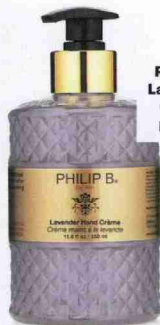
01 Philip B. Rejuvenating Lavender Hand Crème, $35, philipb.com

This jasmine-infused cream has a specific goal: to make your skin appear more awake. The result is a dewy complexion that looks like you just had a serious night of sleep.