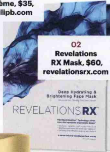
02 Revelations RX Mask, $60, revelationsrx.com